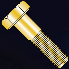
HEX CAP SCREWS